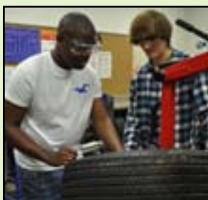
Auto Services page 5