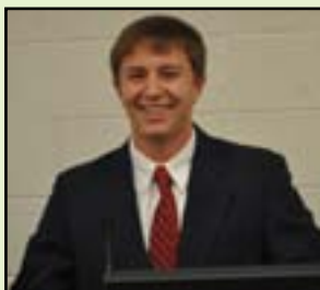
SkillsUSA page 6