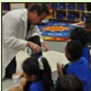
Teaching Pre-K page 7