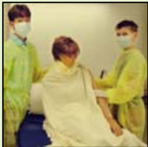
Middle school students page 8