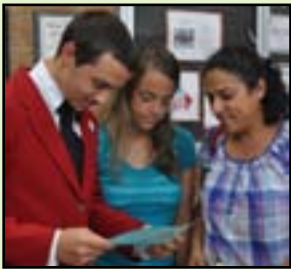
Fall Open House page 6