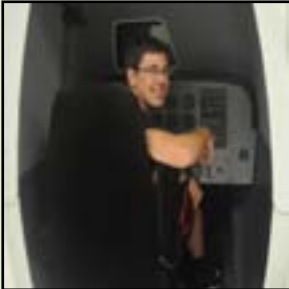
Meyer's donation page 7