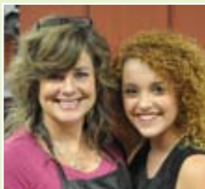
Teacher of the Year page 8