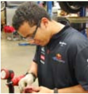
Automotive page 5