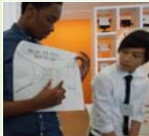
Interior Design page 6