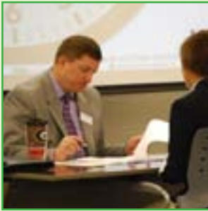
Mock Interviews p. 3