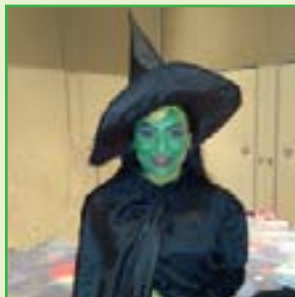
SkillsUSA p. 8