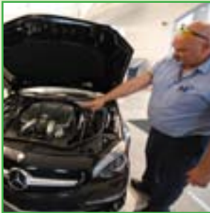
Shadowing p. 4